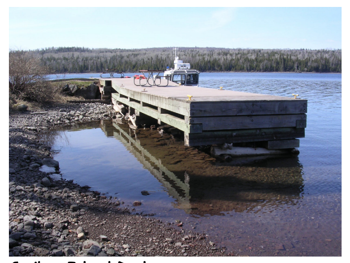
Caribou Island Dock