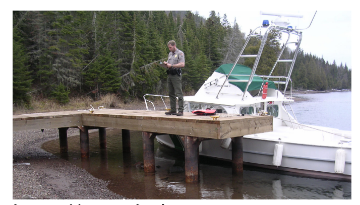
Duncan Narrows Dock