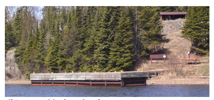
Chippewa Harbor Dock