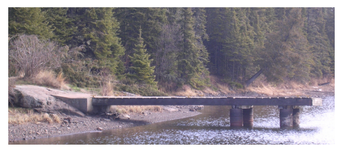
Birch Island Dock