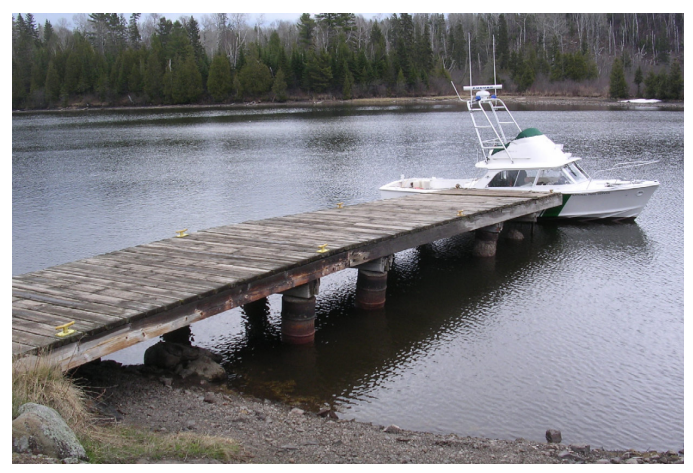
McCargo Cove Dock