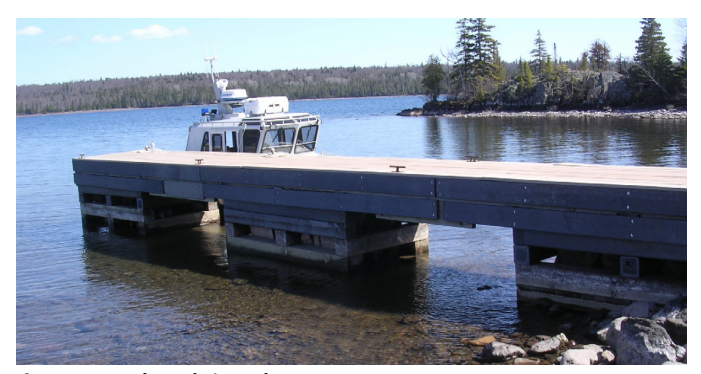
Grace Island Dock